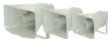
Car Roof Loudhailer Speakers Amplifier